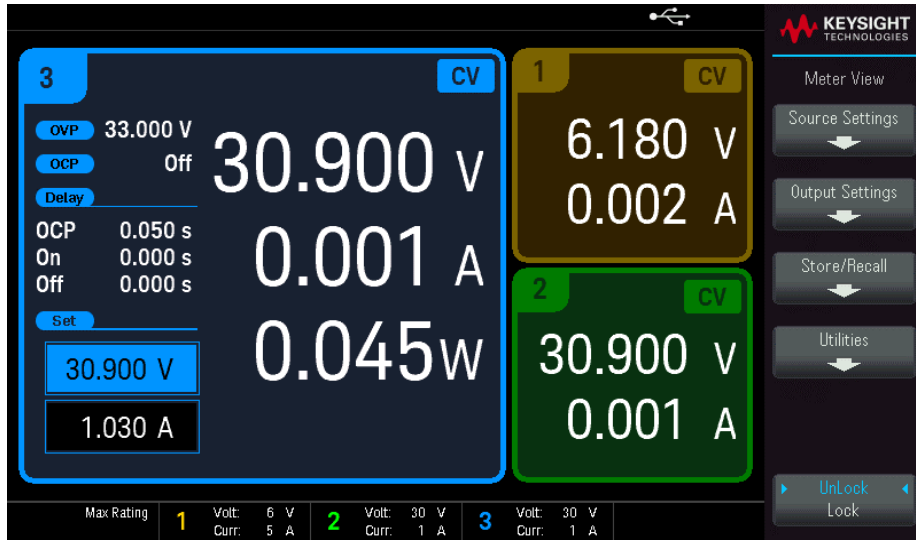
Figure 2. View details of a single channel including the measured power, OVP/OCP condition, and delays.

Figure 2 shows the single-channel view that includes the measured power, OVP / OCP condition, and delays. You can also monitor the readback, voltage and current for the other two channels.