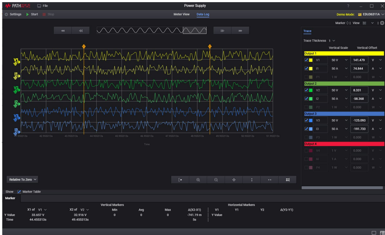
Figure 3. Data-logging with PathWave Benchvue software for the PC